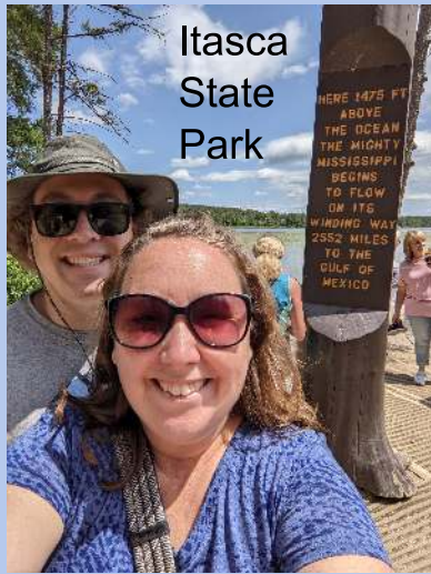
Itasca State Park

We love to travel and have visited many wonderful places!