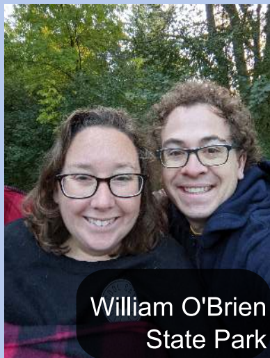
William O'Brien State Park

We love camping, especially at MN State Parks!